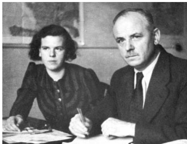
Inge Scholl with her father Robert Scholl in his office, ca. 1940

veloped an independent and astute point of view, distanced from devotion to authority and blind patriotism. Within this realm, he became a role model for his children. Without his father’s influence, Hans would never have evolved from an enthusiastic leader of a Nazi youth organisation into the central character of the group of dissident students.